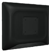
Rear Cover (optional)